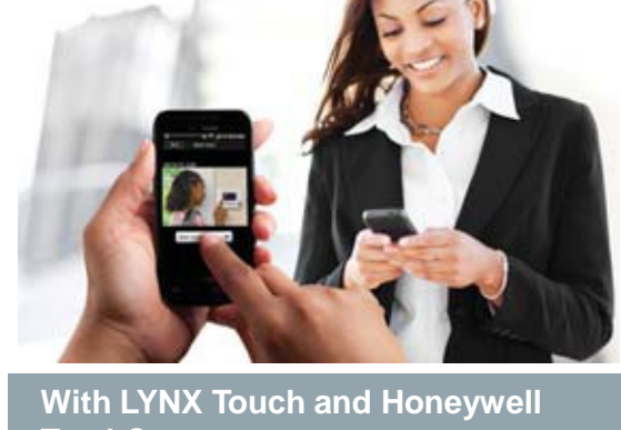
Total Connect you can:

For more information, ask your security dealer.