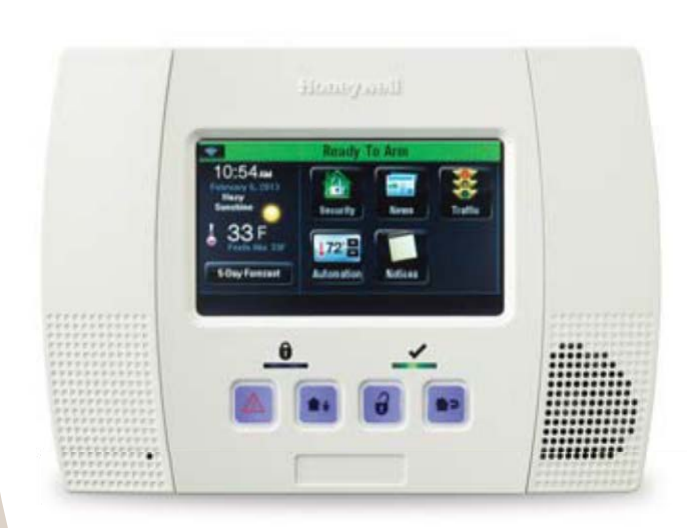
Sleek, stylish look suits any décor.

LYNX Touch Self-Contained Home Control System